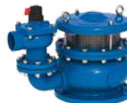
VB-060 + D-070

Please see the table below for all the additional air valve options available.